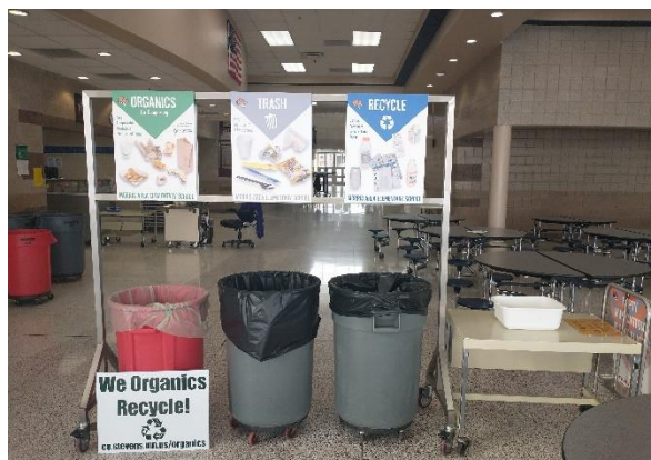
Image B - MAES cafeteria sorting station

The Morris Area Elementary School is the largest Elementary School in Stevens County. The building although attached physically to the Morris Area High School is its own separate entity serving Pre-K to 6 th grade.