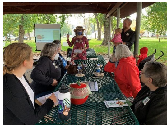
Image G - Community conversation at the Organics Kickoff

Future plans for education and promotion of the organics program include a vendor booth & educational engagement at the Stevens County Fair, a "Drop Site Kickoff" event to show community members the drop sites and give away Organics starter kits, and continual engagement with any community organizations/events that have an interest in Organics recycling.