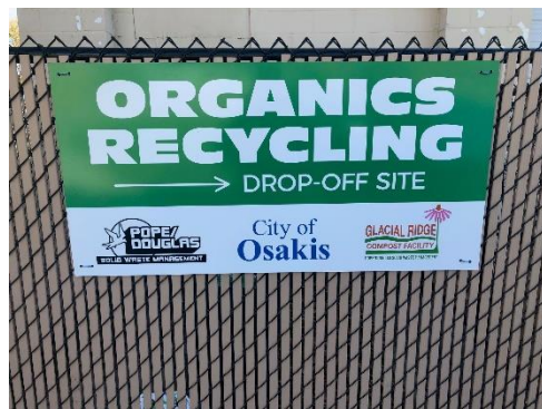
Image J - An example of drop site signage in Osakis, MN. Stevens County will replicate signs like this in English and Spanish