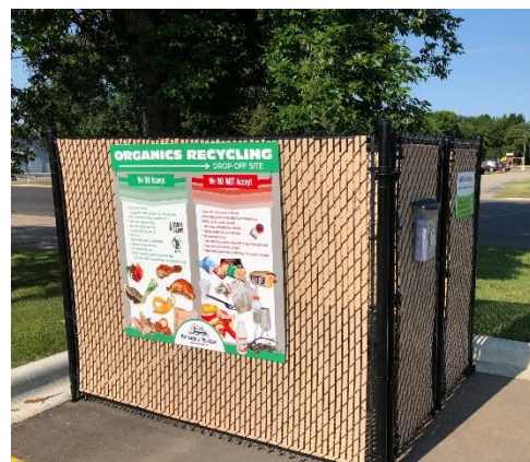
Image 1 - An example of a Douglas County dropsite that will be replicated in Stevens County

From the beginning the Organics Grant partners were interested in many locations for the first organics dropsites. The three locations suggested in the initial grant were the Morris City Shop, the UMN Morris campus, and the Stevens County Highway garage. After discussion and brainstorming, it was determined that the Morris City Shop is the best location for the first dropsite. This location is well known by in and out of town folks as it currently houses a recycling drop off, the annual Christmas tree drop off, and the local grass & brush pile drop off. After discussion with the City Council and City Manager this location was approved for drop site construction.