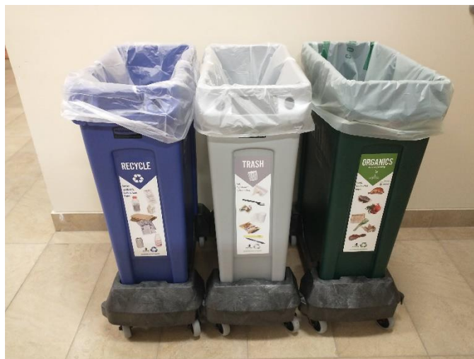
Image E - Three SlimJim containers on wheels with stickers and bags

Signage was designed and purchased through Palmer Creations of Glenwood, MN. This was the same company that designed the PDSWM signage materials, creating a cohesive set of visual education materials across multiple counties in West-Central MN. Stickers were designed by Palmer Creations and purchased through Graphic Xperts of Minneapolis.