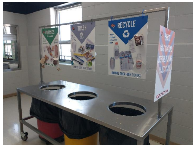
Image D - MAHS sorting table and attached sign stand

Although the signage and materials stayed at the MAHS for most of the spring semester, the school did not utilize green organics bags for most of that time due to the amount of contamination. The program was successful in showing