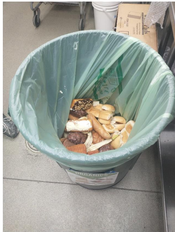
Image F - Organics bin at Willie's SuperValu Bakery

Future plans for organics recycling at businesses and restaurants includes continuing reaching out to more establishments with organics waste to encourage their participation in the program, reach out to facilities with Spanish speaking employees once translation is completed on all signage and educational materials, and continue the process of celebrating and encouraging current program participants.