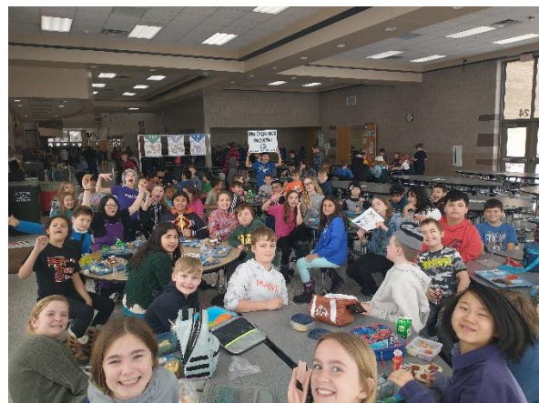
Image C - MAES 5th graders at lunchtime

MAES has participated in a successful organics recycling program in past years due to partnership with UMN-Morris. Starting in 2017 elementary students at MAES would sort their lunch waste into 3 bins: recycling, trash, and organics. Each day staff from UMN-Morris Facilities Management would come to MAES and pick up the organics bin to drop at the UMN-Morris compost pile. These bins did not use bags, as Facilities Management staff was cleaning the bins each day as they were emptied. Students during this time also poured their leftover milk into a separate bucket to get dumped down the drain in the MAES dish room. This ensured that multiple gallons of milk would not be heavy water weight in the compost bins for transport and allowed UMN-Morris Facilities Management to have better control over their compost pile wetness. The UMN-Morris & MAES compost program ended at the start of the COVID-19 pandemic, as students were eating in their classrooms instead of together in the cafeteria.